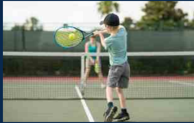
Tennis Courts 2 Synthetic & Clay Court