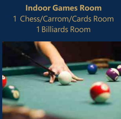
Indoor Games Room 1 Chess/Carrom/Cards Room 1 Billiards Room