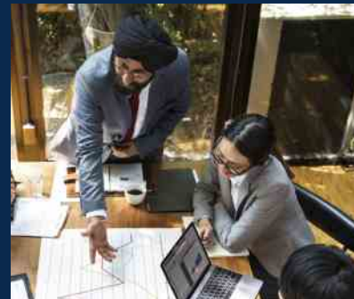
Library & Conference Hall Equipped Library & Spacious Conference Hal