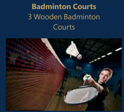
Badminton Courts 3 Wooden Badminton Courts