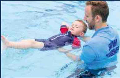
Swimming Pool Dedicated 1 Adults, 1 Children's Swimming Pool