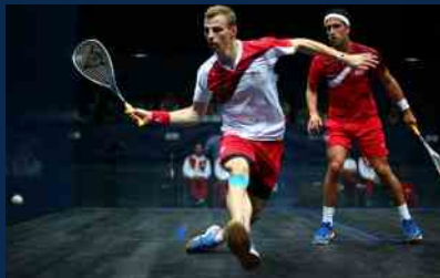
Squash Court 1 Squash Wooden Court