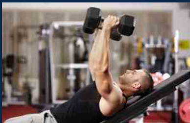
Gymnasium 1 Fully Equipped Modern Gym