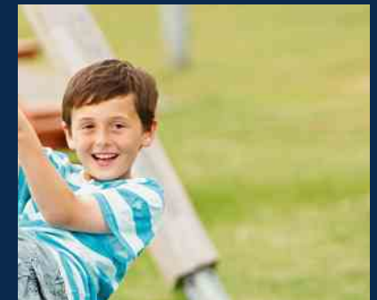
Outdoor Fun Center Dedicated Children's Play Area