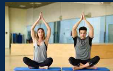
Yoga, Meditation & Spa Peacefull Yoga & Meditation Hall Rejuvenating Spa Facility