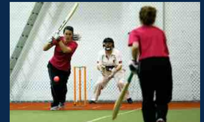
Cricket Pitch 3 Outdoor Cricket Practicing Pitches