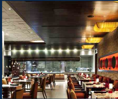
Multi Cuisine Restaurant 2 Storey Restaurant