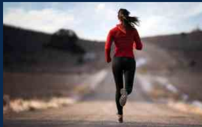
Jogging & Cycling 1 outdoor Jogging & Cycling Track