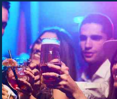
Recreational Lounge Separate Bar lounge facility